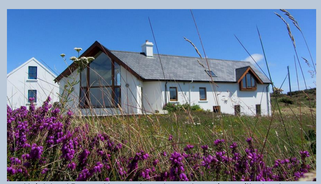
Heir Island Retreat House where the work sessions will take place.

Limited spaces available – early booking is advised to avoid disappointment. A non-refundable deposit of €100 secures your place, and workshop fee is to be paid in full by Thursday 6<sup>th</sup> June. For further information and booking details, please email: linklaterireland@gmail.com