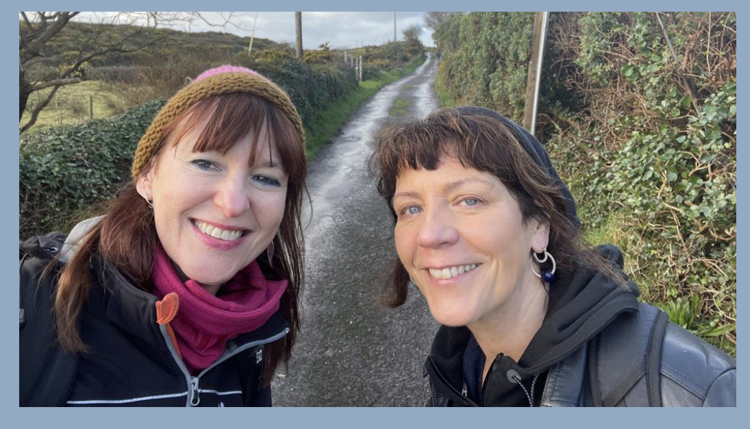
We look forward to voicing with you on Heir Island!

Snout, et al: Act 5: Sc 1, beginning line 153: "In this same interlude it doth befall..."